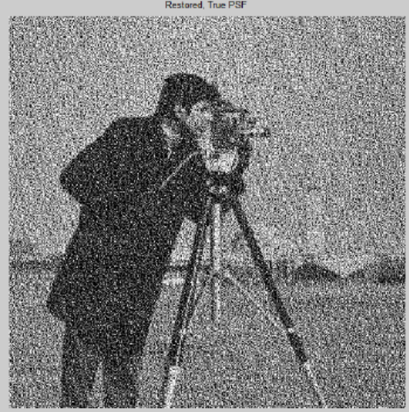
Fig 2. Restored image with true SAF.