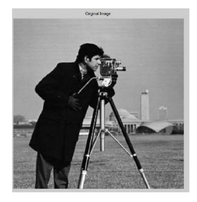
Fig 1. Upload the original image of cameraman for experimental work.

The proposed system consists of main four stages are discrete wavelet transform, denoising wavelet, fusion stage and inverse discrete wavelet transform. The key idea of this proposed is applying DWT on a set of images with two decomposition level. Then is utilized denoising wavelet techniques on the detail coefficient which is performed by soft and hard thresholding with using universal and Bayes thresholds. After that the optimal sub bands for fusion process is selected. Finally, apply IDWT process on fused image to convert it to spatial domain for purpose getting on the output image.