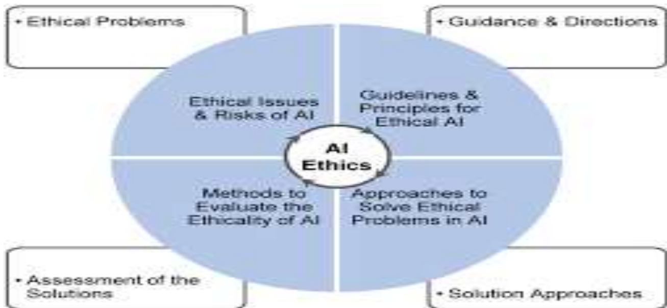
Fig. 2: Overview Of Artificial Intelligence.

2022) Thereafter, appropriate AI ethical principles, policies, guidelines, and rules (i.e., Ethics of AI) may be eventually crafted. By the proper ethics of AI, we are able to design and implement an ethically behaving AI (i.e., Ethical AI). The term ethical question in artificial intelligence refers to the morally wrong or otherwise problematic consequences of AI (i.e., these problems and risks that are caused by the creation, implementation, and exploitation of AI) that must be dealt with. Many ethical issues, such as lack of transparency, privacy and accountability, bias and discrimination, safety and security problems, the potential for criminal and malicious use, and so on, have been identified from the applications and studies. This part is concerned with the ethical problems and risks of AI.