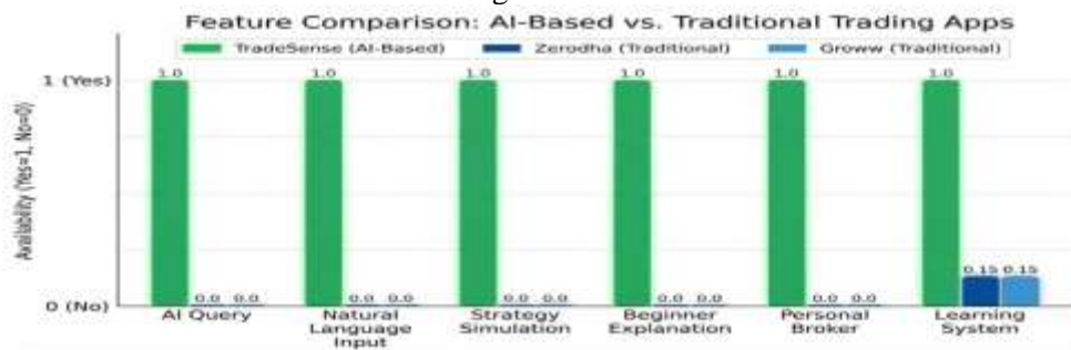
Fig. 2: Features Comparison.

Compared to the current systems, TradeSense has a number of benefits, such as the opportunity to interact using the natural language, getting the real-time access to the data, being deployed on the cloud, and possessing the integrated predictive functionality. All these make the system more efficient and easier to use than the tradition financial tool as shown in fig. 2.